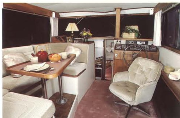
Mid Cabin State Room